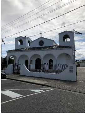
St Anargiri Church: Willesden Road, opened in 1973, replacing a former chapel of the Greek Orthodox Church in Clapham Road. 8

Oakleigh Grammar School: Willesden Road, originally the Greek Orthodox College of St Anargyri opened 1983. 9