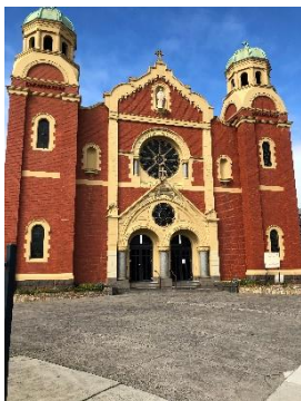
Sacred Heart Church: Archbishop Daniel Mannix laid the foundation stone for this in June 1923 and opened it in March 1925. In 1993 the original Catholic Church, a wooden building, was taken from its site in Dandenong Road to the Sacred Heart school in Thomson Street, to become a school hall. En route it became stuck on the Hanover Street bridge. 11

Sacred Heart Girls College , 113 Warrigal Road, opened 1957 by the Sisters of Our Lady of the Missions. The building (on the south-west corner of Warrigal Road and Kangaroo Road) was designed by Frederick Romberg who migrated to Australia from Switzerland in 1938. From 1953 until 1962 he was part of the partnership [Roy] Grounds, Romberg and [Robin] Boyd. Romberg also designed, amongst other things, the octagonal Picken Court building at Ormond College, the ETA food factory in Braybrook, and St George's Anglican Church, East Ivanhoe. He was awarded the inaugural President's prize of the Victorian Chapter of the Royal Australian Institute of Architects. 10